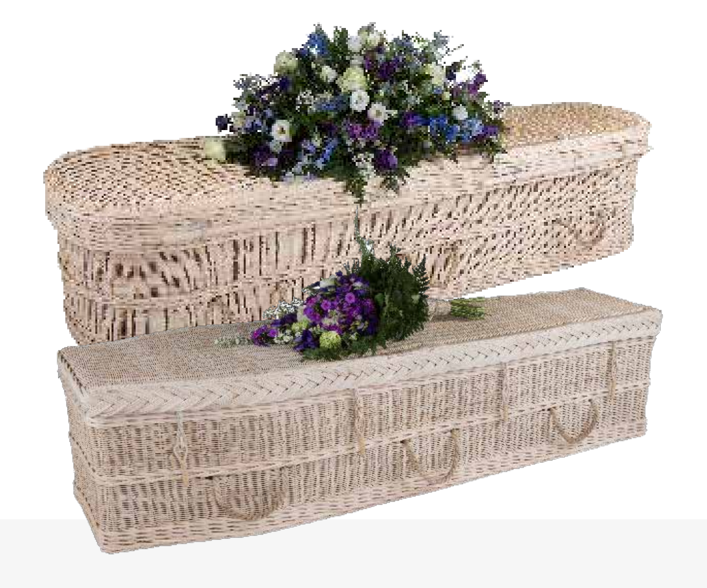
The CANE by Naturally Woven

Handcrafted using woven cane, sometimes referred to as wicker or rattan, holding an off-white appearance and are skillfully finished by hand using traditional basket making techniques. The rattan used for our coffins is harvested from the forests of South East Asia where rattan clings and grows up the existing forest trees like a vine. Rattan has been known to grow as much as six metres in a year making it a great renewable material. The coffins are available in two differing shapes, curved end (rounded) and traditional shape (square) each tapering from end to end. Both styles come in a range of finished sizes with natural rope handles and fully fitted with natural linings, pillow and covers.