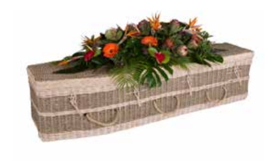
The SEAGRASS by Naturally Woven