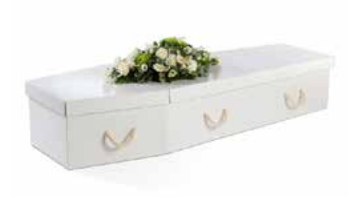
The CARDBOARD WHITE by Eco Coffins