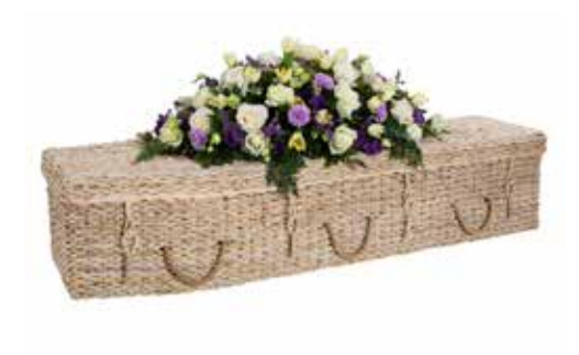
The BANANA LEAF by Naturally Woven