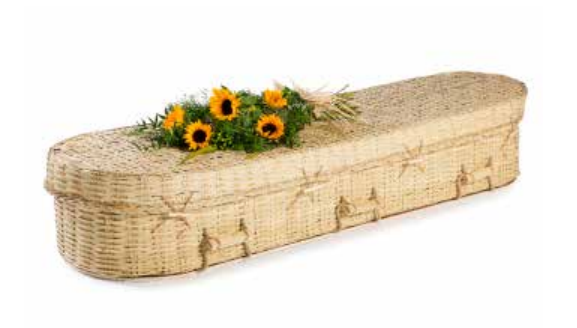
The BAMBOO ECO by Eco Coffins