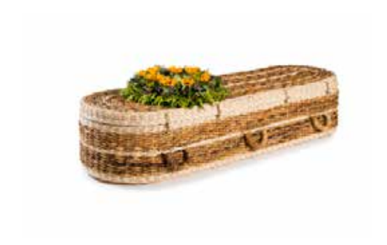
The BANANA Round by Eco COffins