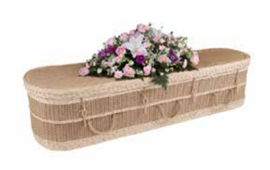
The LOOM by Naturally Woven