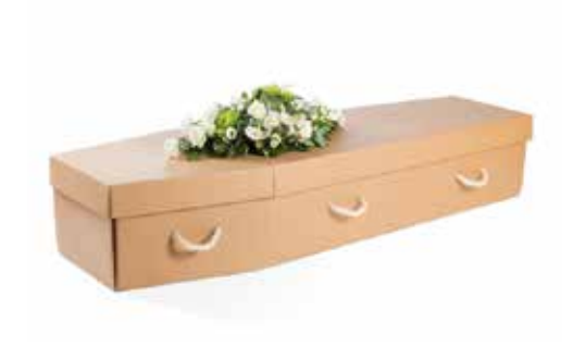
The CARDBOARD MANILA by Eco Coffins