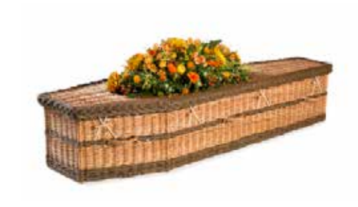
ENGLISH WILLOW by Eco Coffins