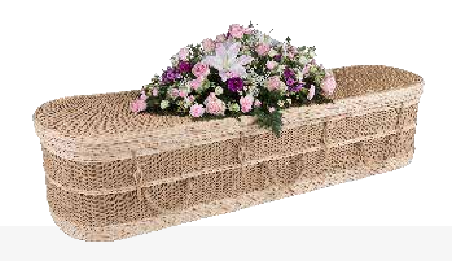
The LOOM by Naturally Woven

Our Loom coffins are made from natural paper which has been spun into long yarns and woven around a substantial cane frame. The Loom coffins are light brown in appearance with cream coloured cane implemented into the design and fastened closed with plaited loops and toggles. The coffin is available in the curved end shape (rounded) tapering from end to end and available in a range of finished sizes with natural rope handles and fully fitted with natural linings, pillow and covers.