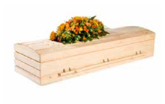
The PINE by Eco Coffins