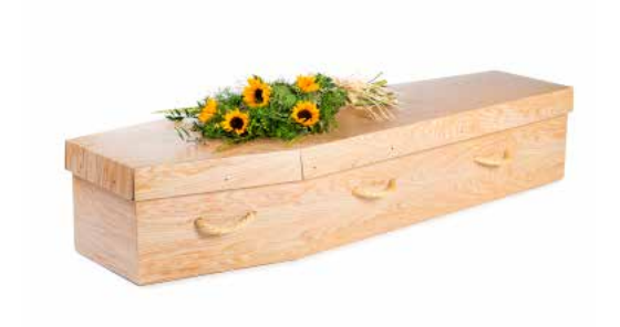
The CARDBOARD WOOD by Eco Coffins