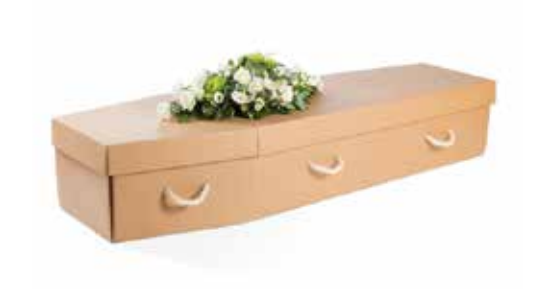
The CARDBOARD MANILA by Eco Coffins