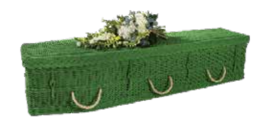
The COLOURS by Naturally Woven