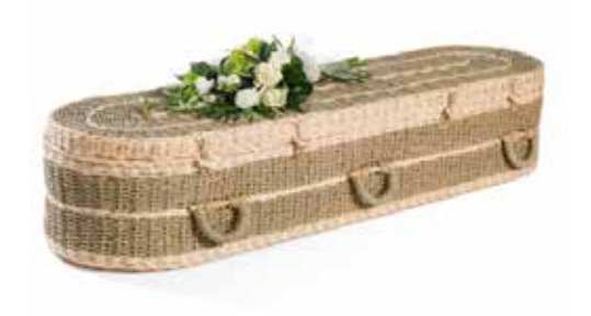
The PANDANUS by Eco Coffins