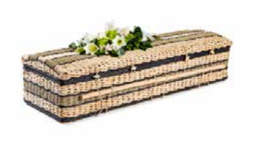
The BANANA Casket by Eco Coffins