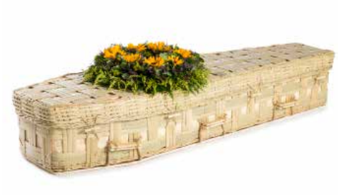
The BAMBOO LATTICE by Eco Coffins