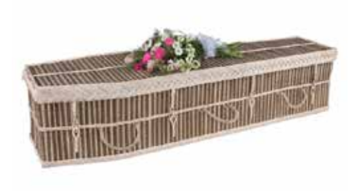
The COCOSTICK by Naturally Woven