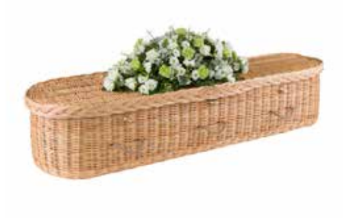
The WILLOW by Naturally Woven