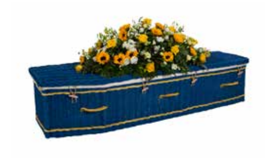
The SOMERSET COLOURS by Somerset Willow