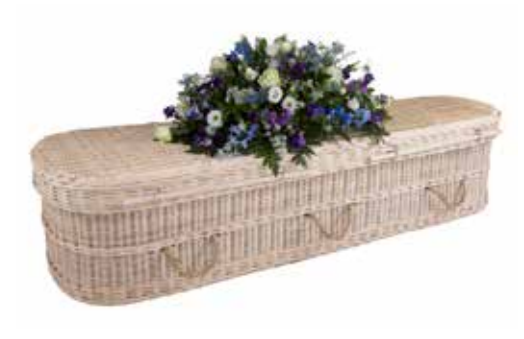
The CANE by Naturally Woven