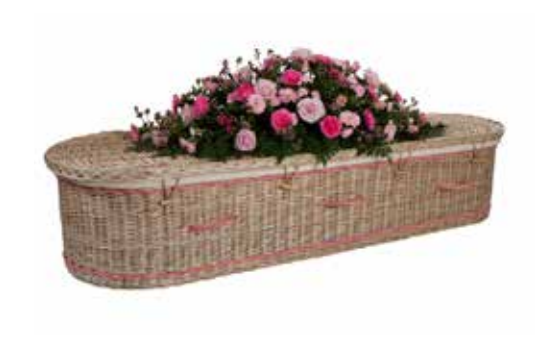
The SOMERSET WILLOW by Somerset Willow