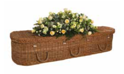
The WICKER by Naturally Woven