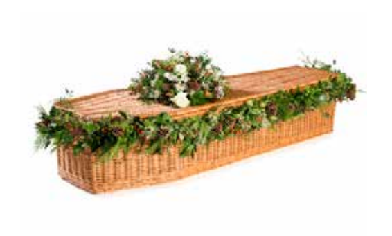
The HIGHSTED Willow by Eco Coffins