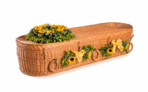
The CROMER Willow by Eco Coffins