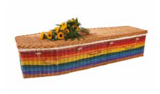
The SOMERSET RAINBOW by Somerset Willow