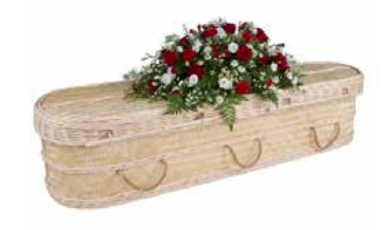
The BAMBOO WOVEN by Naturally Woven